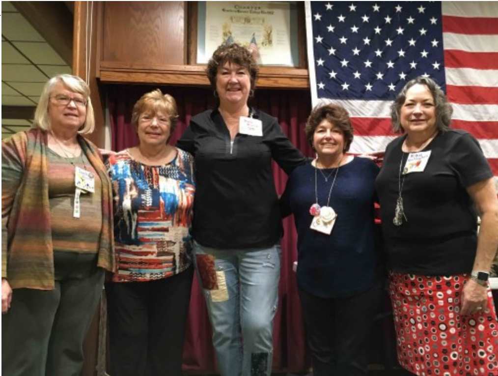
2020 Slate of Officers