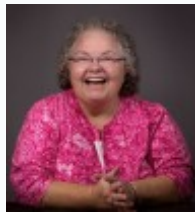
OGQG Facebook Page Reminder

For those of you that are on the Orange Grove Quilters Guild Facebook Page, I want to remind you that you must be a member to join, and also to continue to follow the page.